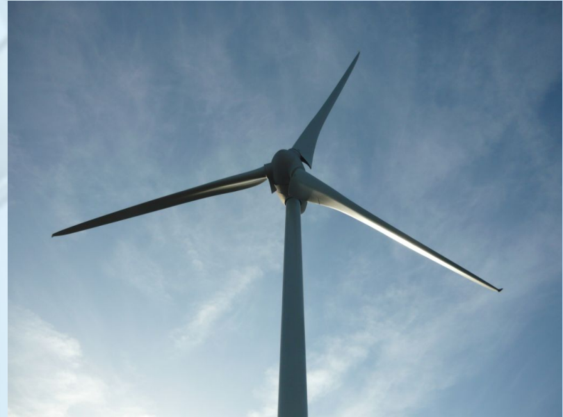
4.6 MW Zero Emission People Wind Farm No. 1 Wind Works' first operating asset

Wind Works now operates 4.6 megawatts (MW) in Germany, in which it has a 49% ownership stake. In addition, Wind Works is developing its permitted and contracted 105 MW Thunder Spirit project in North Dakota, 50 MW of Feed-in Tariff contracted projects in Ontario with Capstone Infrastructure, plus an additional 20 MW on its own; 77 MW of near-term permitted projects in Germany; and a 120 MW project pipeline in the United States.