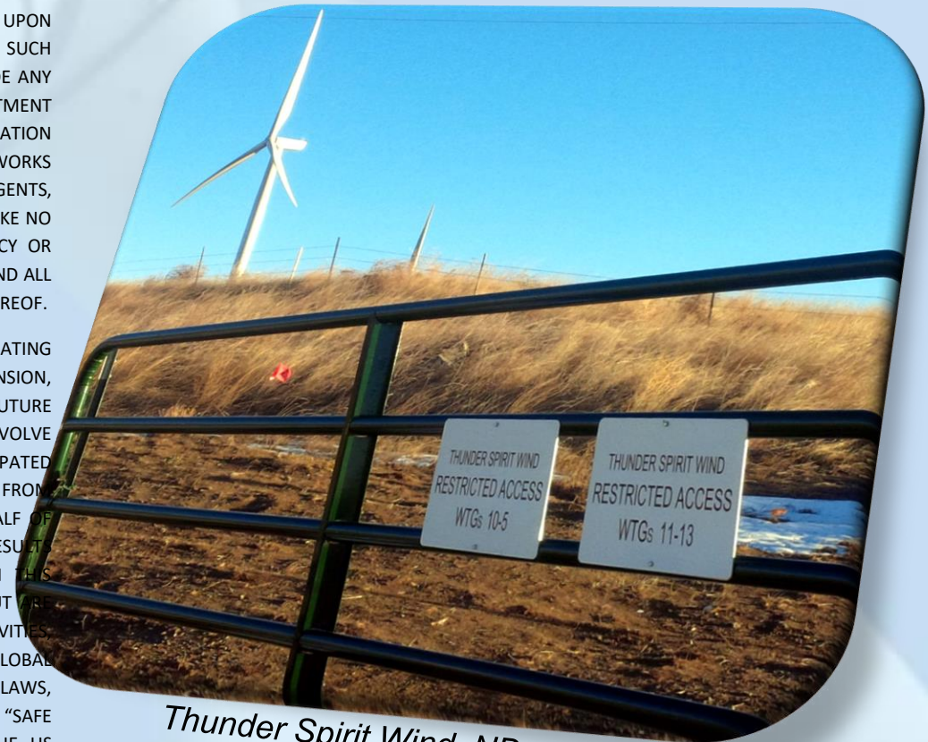
Thunder Spirit Wind, ND, 2015/18

COMPANY RESERVES THE RIGHT TO AMEND OR REPLACE THE INFORMATION CONTAINED HEREIN, IN PART OR ENTIRELY, AT ANY TIME AND UNDERTAKES NO OBLIGATION TO PROVIDE THE RECIPIENT WITH ACCESS TO THE AMENDED INFORMATION OR TO NOTIFY THE RECIPIENT THEREOF.