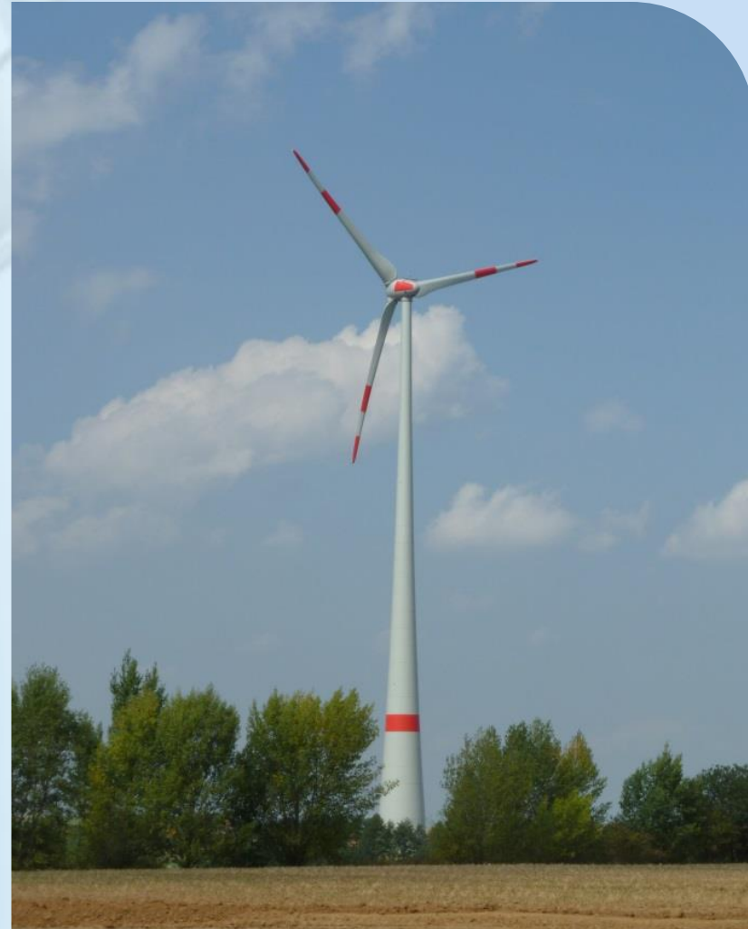
Wind Works' project Burg I & II - in operation 5 x Enercon E82 8