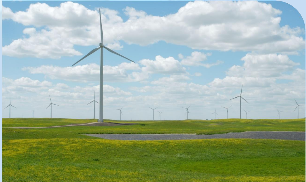
180 MW Tatanka Wind Farm, North & South Dakota